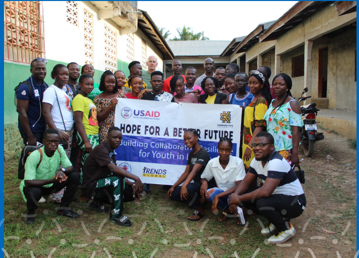
KENNESAW STATE UNIVERSITY. Local youth participants and staff of HOPE pose next to a project banner.